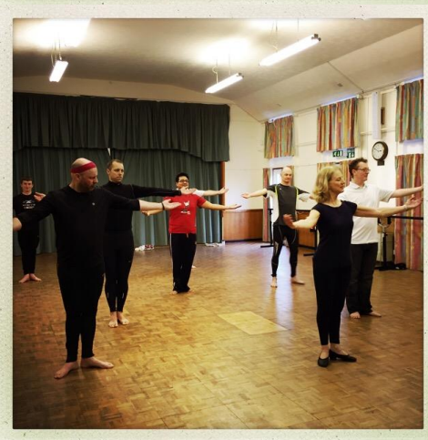
Video and more photos are on our Facebook page