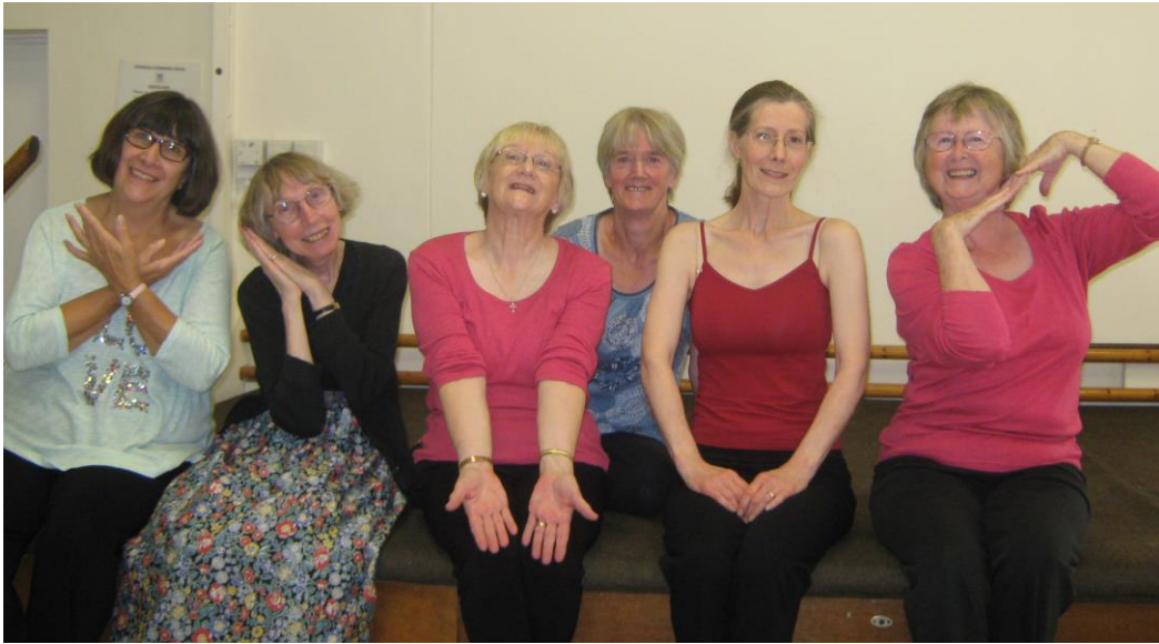
Just a few of the talented tip-toers