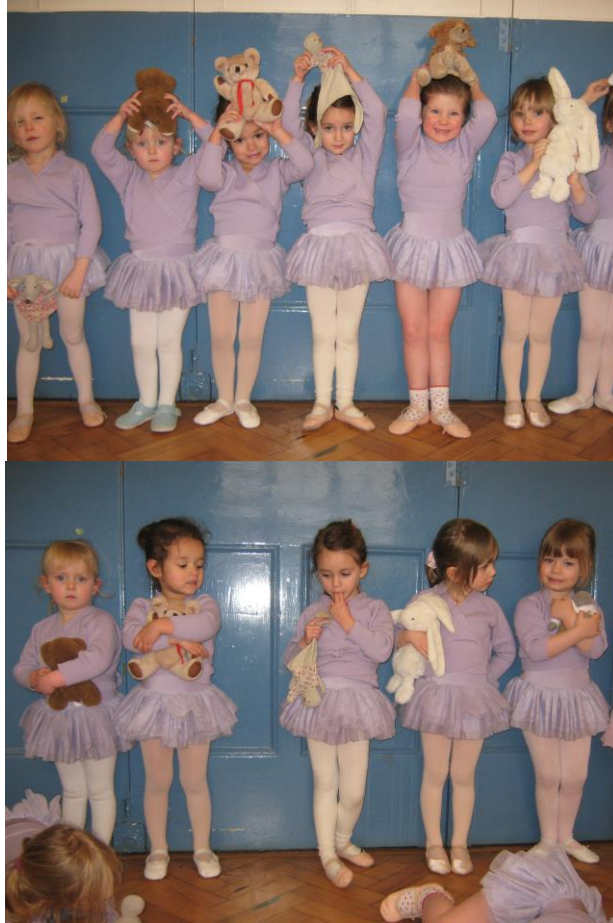
Learning to wait their turn - and succeeding - well done!